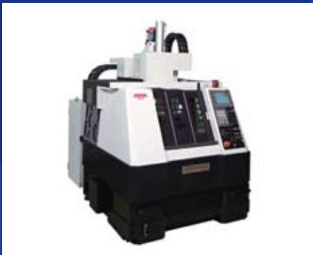
Travel range (XYZ): (410 • 330 • 200) mm

You are entrusted with the latest technology in our resources and capabilities