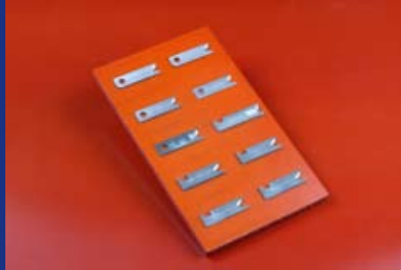
Automotive & Electronics