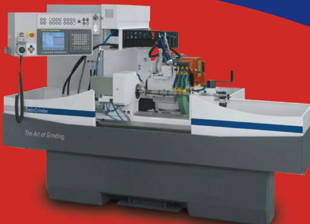
CNC Cylindrical Grinder Maximum Diameter: \varnothing 350mm; Maximum length 650mm