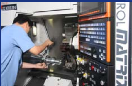
Maximum Diameter: \phi 350mm; Maximum Length: 1000mm