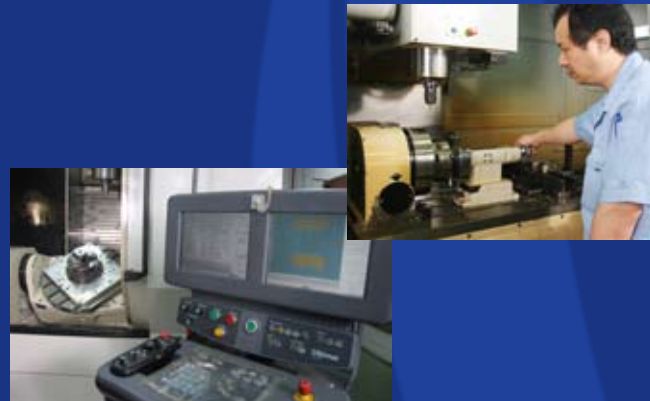
Travel range (XYZ): (800 • 700 • 510) mm

Our HURCO VTXU is ideal for 5-axis positioning work on complex, multi-sided parts where reductions in setup time and overall part accuracy are critical.